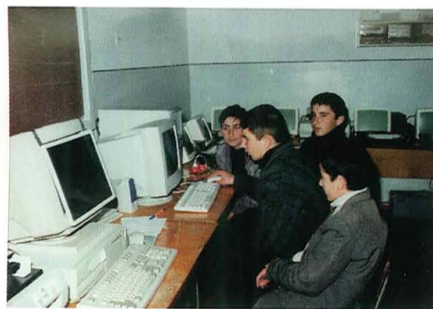
Children working in computer lab.

Armenia Fund USA has experience working with the World Bank.