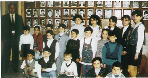
Orphans in front of a memorial wall of their fathers' photos at Stepanakert Number One School.

A potential annual shortfall of $150,000 is being created in the Orphans Endowment Fund, because the Hayastan All-Armenian Fund has begun distributing money to the children of those killed or severely wounded in the Karabagh war, even though slightly more than half the $1.5million target has been reached.