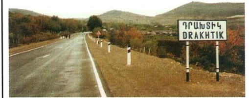
Completed Section of North-South Highway.