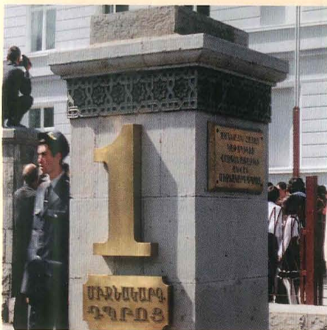
Vanadzor #1 school

More than 1,500 people donated more than $650,000 for the reconstruction project, which took 11 months for completion. "In addition to being completed on time," Kevork Toroyan said, "it was completed under budget. Thus, we have funds available for fine-tuning and the initial phase of maintenance."