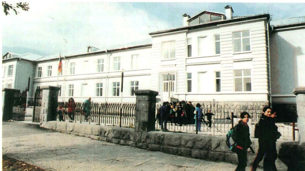
First Day of School for the newly reconstructed Vanadzor School Number One, September 24, 2001.