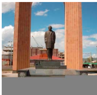
Aznavour’s statue in Gyumri, Armenia

“Bonjour, this is Charles Aznavour. I am calling you today because we are in need, in urgent need of a large number of things. Our important Diaspora in the world should be generous and help fundraising actions for our sisters and brothers who do not have the same luck we have ... thank you, good-bye.” With