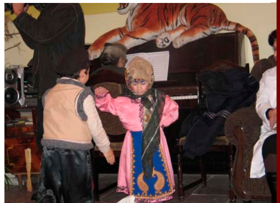
A little girl performing a traditional Armenian dance at Nork Orphanage