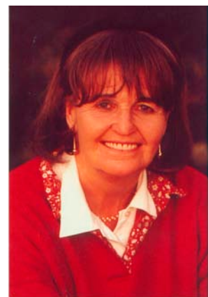
Baroness Caroline Cox of Queensbury, British House of Lords

Karabakh, is a renowned philanthropist and human rights advocate. Her humanitarian work has taken her on many missions to “no-go” conflict zones in Sudan, Nigeria, North Korea, Indonesia, Burma and Nagorno-Karabakh. Visiting Armenia and Nagorno-Karabakh more than sixty times, the Baroness witnessed the people’s suffering during and after the crisis of the Nagorno-Karabakh conflict. This and her other involvements with issues and concerns of the needy around the world have made Baroness Cox a “voice of the voiceless” (continued page 2)