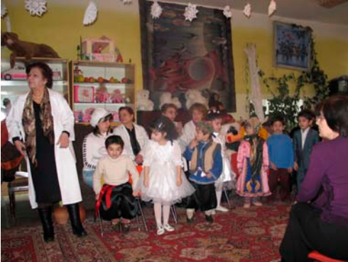
Performance at Nork Orphanage

Constructed in 1937 and currently located in the district of Nork, “Children’s Home” orphanage in Yerevan has been intended for children aged 6 years and under. Today, it gives shelter to about 80 children, with an average of 150 children annually passing through its portals. Once children reach the age of 6, they are relocated to other orphanages throughout Yerevan, Gavar, and other towns. When necessary, the orphanage in Gyumri, which specializes in the care of children with various neurological illnesses and disabilities, is accessed by children with special needs.