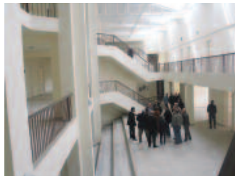
School After: The Gyumri school 2 years after Armenia Fund rebuilt the entire school complex