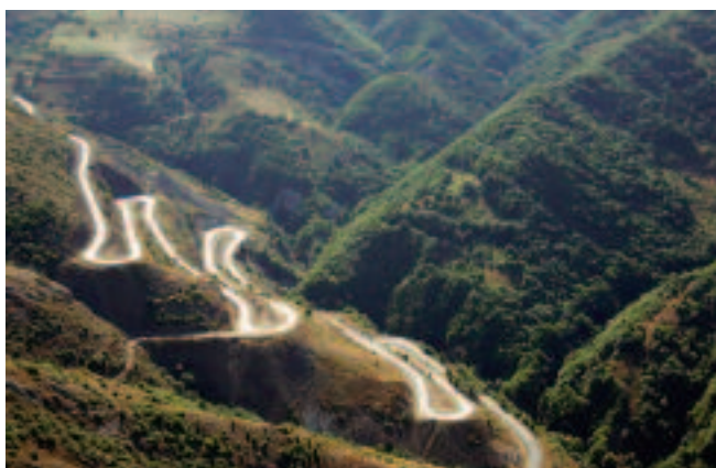
Goris-Stepanakert Highway — the “Life Road” of Artsakh connecting Karabakh to Armenia, 1996

By 1996, four years after its establishment, Armenia Fund’s projects were already in full swing. These years were most significant as this was when the Fund’s mission and objectives were expanded to include major strategic initiatives in a wide range of areas – large-scale infrastructure, social and economic well-being, public health, as