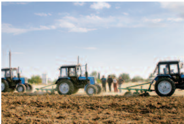
Agricultural Development Associations are established in the Mardakert and Hadrut regions of Karabakh

"Build a New Horizon" dubbed Armenia Fund's 2005 International Thanksgiving Telethon. It was, however, more than just a slogan. The campaign was a call of confidence for new directions that the organization was taking to better address pressing needs of development in Armenia and Karabakh.